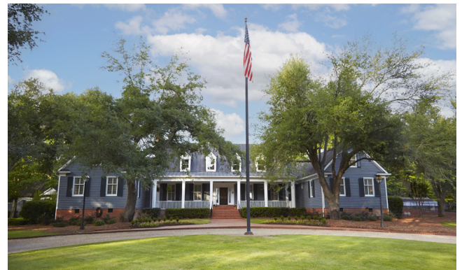
Substance Use Inpatient Program in Augusta, Georgia