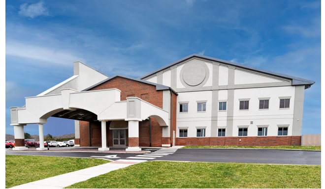
Veteran-Specific Program in Dallas, Pennsylvania