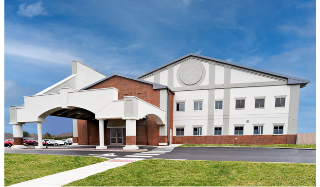
Veteran-Specific Program in Dallas, Pennsylvania