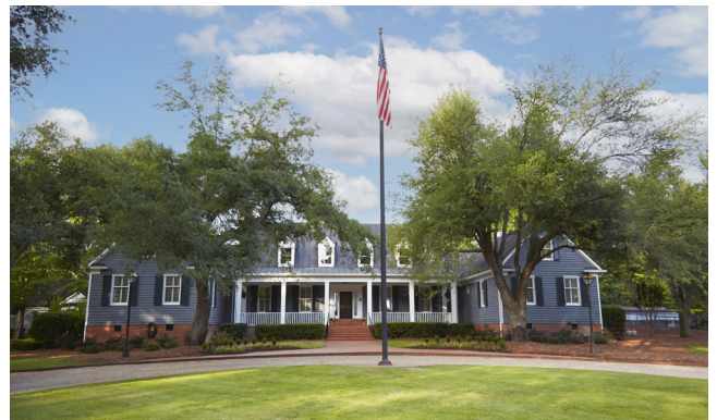
Substance Use Inpatient Program in Augusta, Georgia